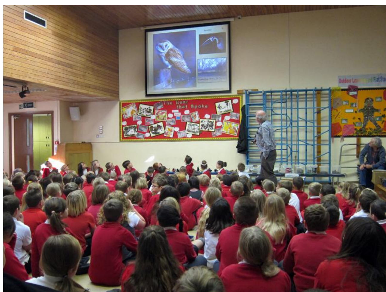
Presentations to schools