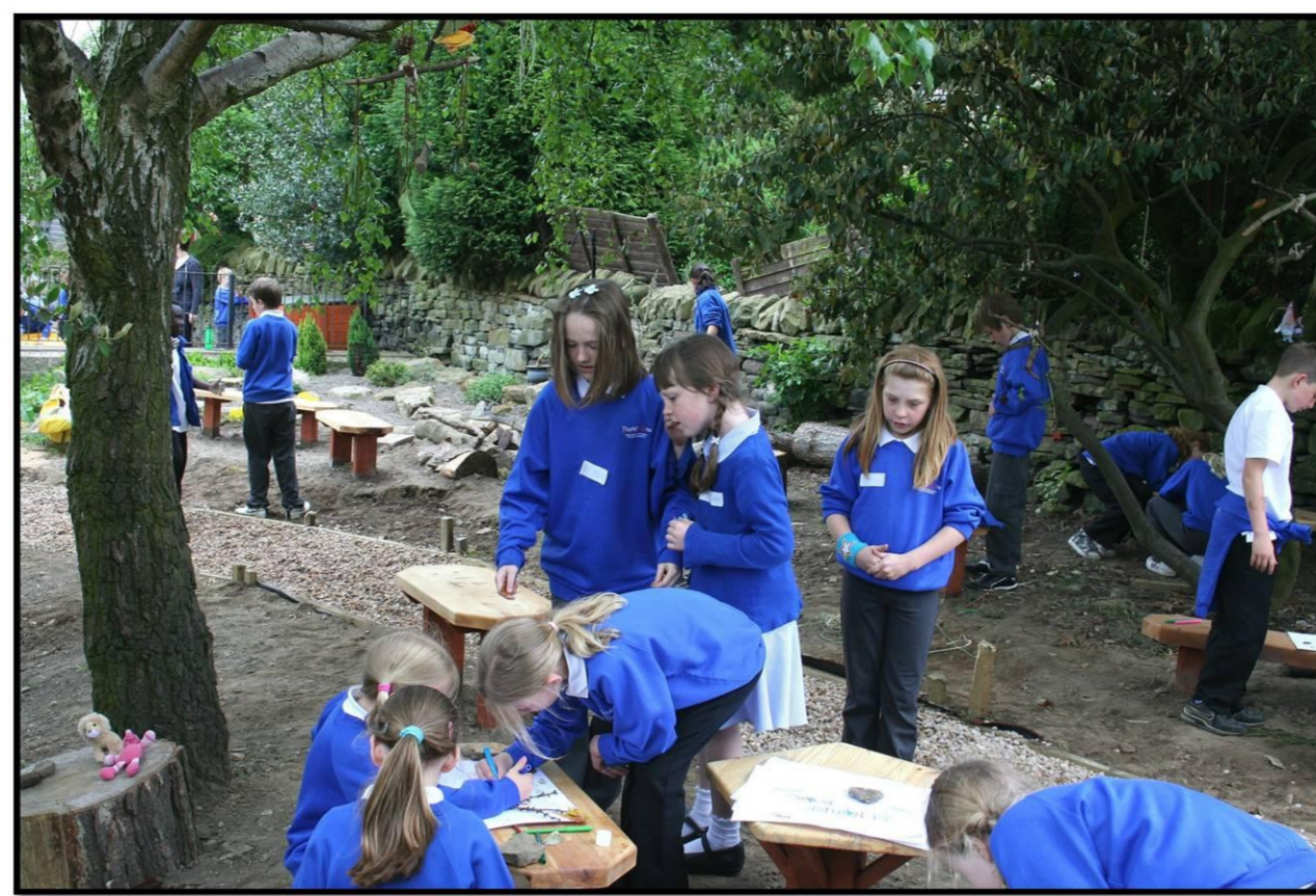
Children actively involved